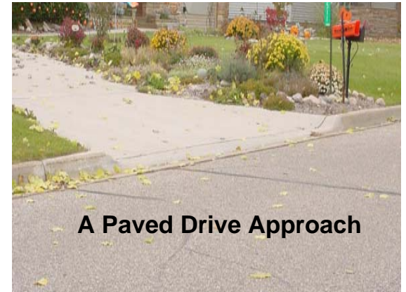
A Paved Drive Approach

The City Commission hopes to encourage private homeowners to pave the approach to their driveways. They have set up a voluntary program to cover 50% of the cost of paving a gravel drive approach up to a maximum of $450.00.