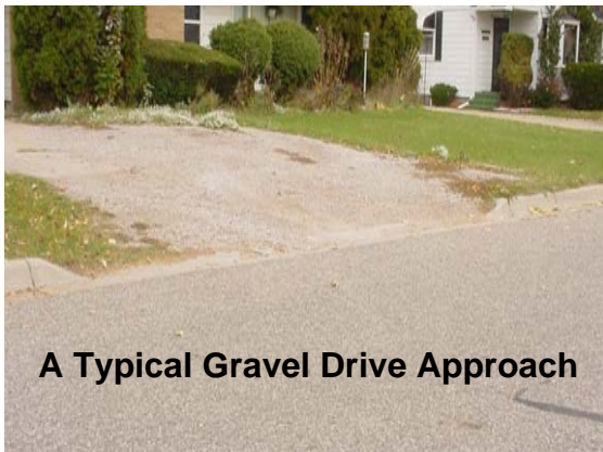
A Typical Gravel Drive Approach

Gravel drive approaches can create real issues for municipalities. The Michigan Department of Environmental Quality has strict regulations concerning the disposal of street sweepings. Street sweepings that are collected by the City must be disposed of in a Class II sanitary landfill. Each year, the City of Mt. Pleasant spends approximately $25,000 to dispose of the sweepings. In addition, the total annual cost of sweeping streets is approximately $40,000.